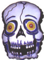
* 9" Bonehead Mini Shape NL (white backside) 425013 (Category IV)