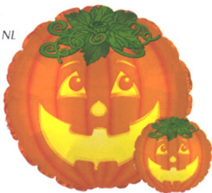
18" Glowing Pumpkin Face NL 114300 9" Miniloon™ NL 124300