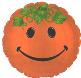
18" Smiley Face Pumpkin NL 114301