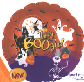
© Hallmark Licensing, Inc. 18" Halloween Figures NL 112224