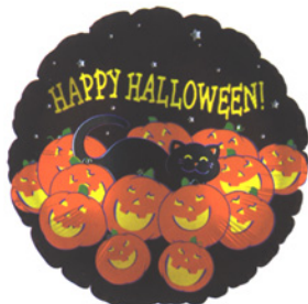
© Hallmark Licensing, Inc. * 18" Hallmark Pumpkin Patch NL 115321